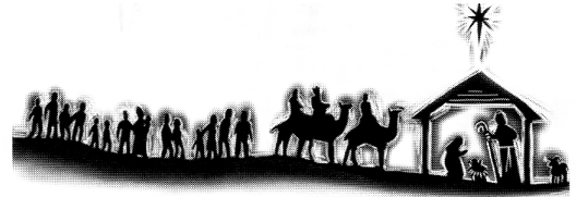
Wise Men and Women Still Seek Him

The Board of Deacons would like to thank all those who ordered Poinsettias to decorate and beautify our chancel during Christmas services. Also many thanks for the overwhelming responses to the Lyon Manor White Gifts that were delivered by our carolers!